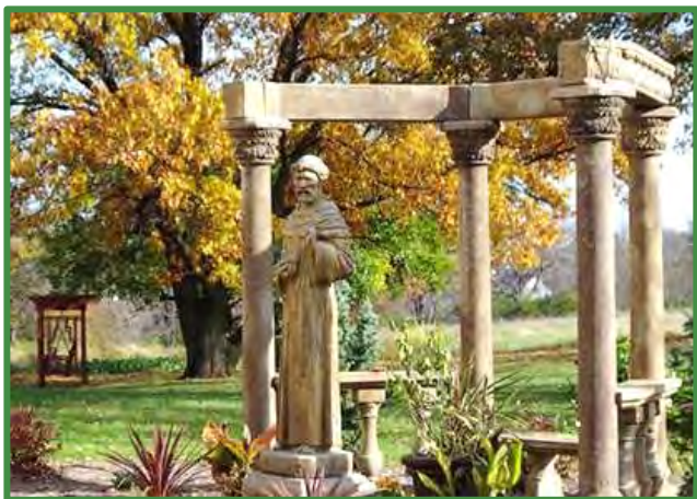
Pallottine Renewal Center Gardens

Please join United States consecrated virgins at the annual convocation to be held July 7-11 at Pallottine Renewal Center just outside St. Louis, Missouri. This year the convocation is themed “The Blessed Virgin Mary, Queen of Virgins” and each day will address themes of ongoing formation, our Lady, and the communion of saints.