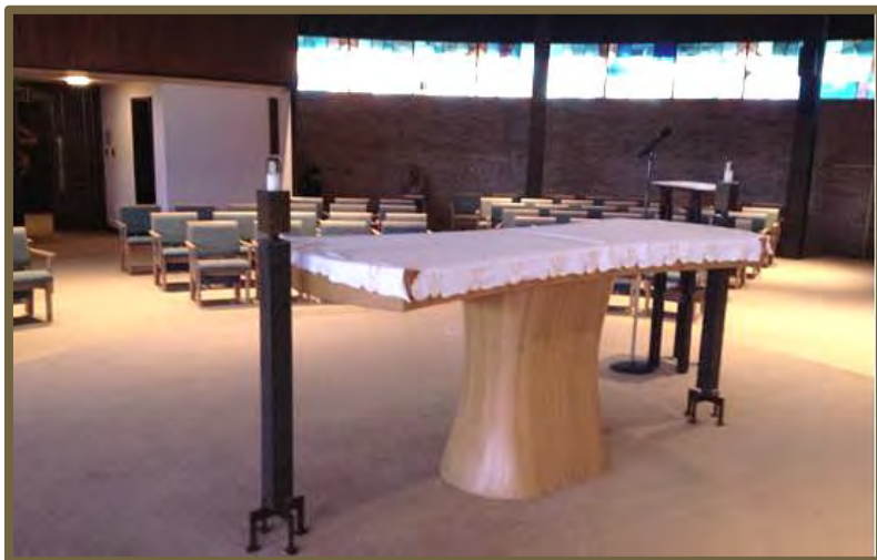
Pallottine Renewal Center Chapel Florissant, Missouri

Once again, we encourage all consecrated virgins and candidates who have attended an Information Conference to join us for this wonderful time of study, prayer, and community at the 2017 Convocation. We hope to see you all in July!