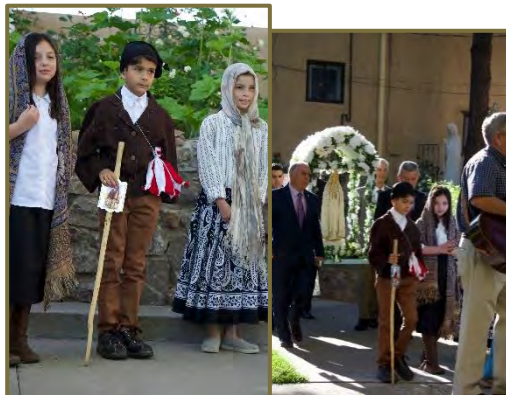
Children dressed as the seers of Fatima join the procession.